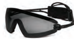
ZANT FAST METAL NSN #01-729-1700