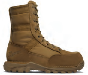
RIVOT TFX DANNER | # TFX 51514