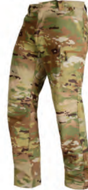
L5 | RIG SOFTSHELL PANT BEYOND CLOTHING MEN'S #1212P-M5-4007-F24 WOMEN'S #1212P-W5-4026-F25 SIZES XS-2XL