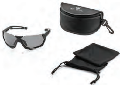
SLINGSHOT SUNGLASSES APEL U.S. MILITARY KIT REVISION MILITARY NSN #01-728-5777