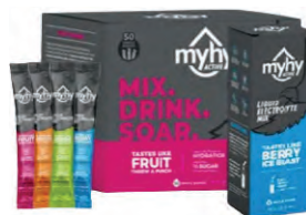
LIQUID ELECTROLYTE MIX MYHY | 500x sticks(single serving) per case. C-ASS50-BRY (Berry) C-ASS50-FP (Fruit Punch) C-ASS50-OR (Orange) C-ASS50-LL (Lemon Lime)