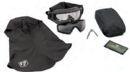
SNOWHAWK GOGGLE & BALACLAVA REVISION MILITARY BALACLAVA WHITE (MEDIUM) NSN #01-687-5895 BALACLAVA WHITE (LARGE) NSN #01-687-5904 BALACLAVA BLACK (MEDIUM) NSN #01-687-6068 BALACLAVA BLACK (LARGE) NSN #01-687-6072 BALACLAVA TAN (MEDIUM) NSN #01-687-6082 BALACLAVA TAN (LARGE) NSN #01-687-6083