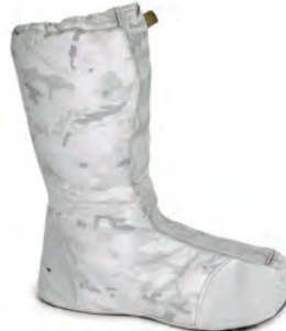
CHOSIN ECW OVERBOOT BEYOND CLOTHING #1212-M8-5001-F24 Multicam Alpine or Multicam SIZES XS/S, M/L, XL/2XL