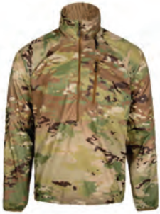
L5 | RIG SOFTSHELL JACKET - NSR BEYOND CLOTHING MEN'S #1212P-M5-3014-F24 WOMEN'S #1212P-W5-3024-F25 SIZES XS-2XL