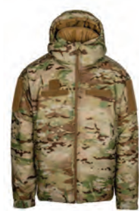
L7 | COLD JACKET - NSR BEYOND CLOTHING #1212P-A7-0157-C20 SIZES XS-2XL