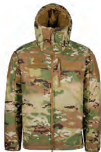
MOUNTAIN JAGER JACKET - NSR BEYOND CLOTHING #1212P-A3-3302-M13 SIZES S-2XL