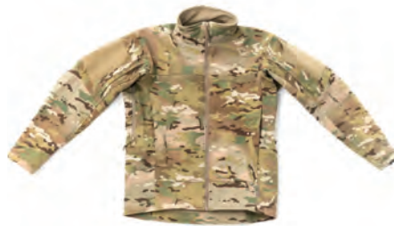
SOFT SHELL JACKET WILD THINGS | #50007-9MU SIZES XSmall - XXXLarge