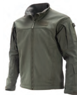
ELEMENTS™ JACKET NAVAIR WITH BATTLESHIELD X® FABRIC (FR) MASSIF #MJKT00005-BSXSG