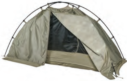
EXTREME COLD WEATHER KIT FOR LITEFIGHTER SHELTERS LITEFIGHTER SYSTEMS 1 PERSON NSN #01-719-5189 2 PERSON NSN #01-719-5191