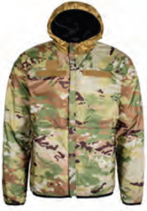
ALPHA LOCHI JACKET - NSR BEYOND CLOTHING #1212P-A3-0169-C20 (NSR) SIZES XS-2XL