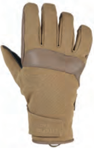
SHERPA COLD WEATHER GLOVE COACHYS & ASSOCIATES NSN #01-719-4929 (LARGE)