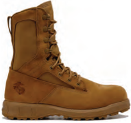
510 MEF BELLEVILLE