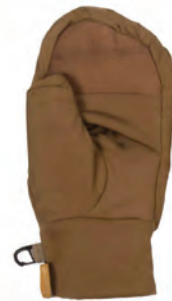
JAGER FLIP MITT BEYOND CLOTHING #1212P-M5-6002-F24 S, M, L, XL, 2XL