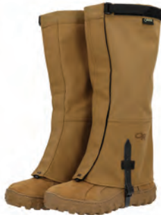
EXPEDITION CROCODILES OUTDOOR RESEARCH #8440016789096 (large) SIZES S,M,L,XL