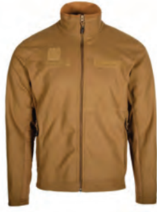
RA FLEECE JACKET - NSR BEYOND CLOTHING #1212P-A3-0106-C20 (NSR) SIZES XS-2XL