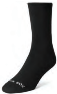
RUCK SOX 2.0 RUCK SOX OD Green, Coyote or Black