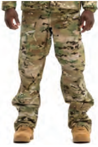
LOW LOFT PANTS - FR WILD THINGS | #50165-9MU SIZES XSmall - XXXLarge