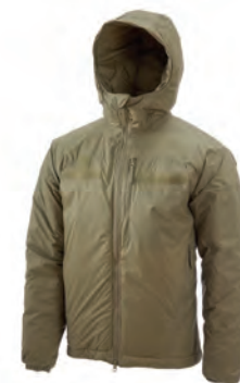
CIRRUS HIGH LOFT JACKET (NON-FR) MASSIF #MJKT00086 SIZES XS-2XL