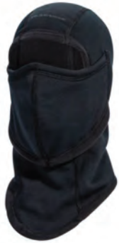
CORE BALACLAVA COLD AVENGER #CA-WPBAL-SM-BLK #CA-WPBAL-MD-BLK | #CA-WPBAL-LG-BLK