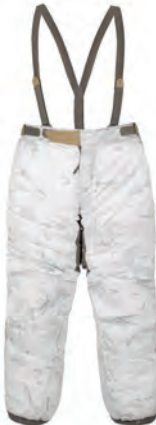
L7 | COLD PANT BEYOND CLOTHING #1212P-A7-8004-C20 SIZES XS-2XL