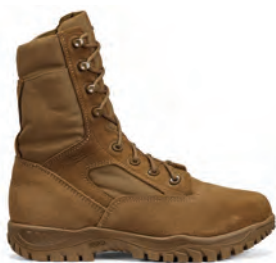
FLYWEIGHT C312 BELLEVILLE