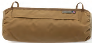
KNUCKLE ROASTER WILD THINGS COYOTE #60180-2CY MULTICAM #50180-9MU MULTICAM ALPINE #70012-1MA