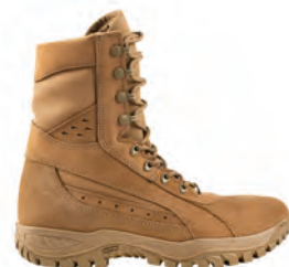
FLYWEIGHT FX2 BELLEVILLE