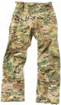
HARD SHELL PANTS- FR-GT WILD THINGS | #60282-2CY SIZES XSmall - XXXLarge