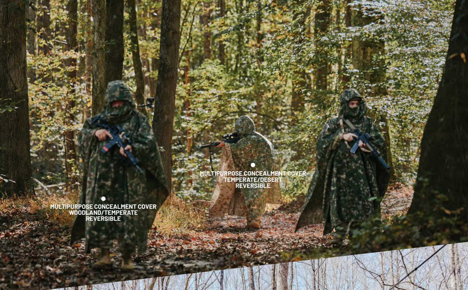
MULTIPURPOSE CONCEALMENT COVER WOODLAND/TEMPERATE REVERSIBLE