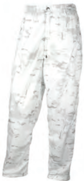
WHITE OUT OVERWHITES™ PANTS WILD THINGS | #70001-1MA (XS-XXXL)