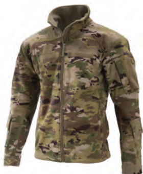
ELEMENTS™ JACKET IWOL WITH BATTLESHIELD X® FABRIC (FR) MASSIF #MJKT00065-BSXOC SIZES XS-2XL