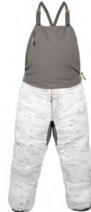
L8 | CHOSIN ECW BIB BEYOND CLOTHING #1212P-A8-8002-C01 SIZES XS-2XL