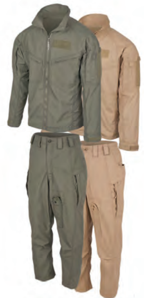
2 PIECE FLIGHT SUIT - NAVAIR MASSIF Men's Fit: #MJKT00062 Women's Fit: #MJKT00064