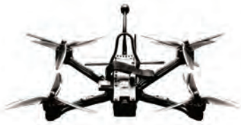
MATRIX 3 TANDEM DEFENSE #TD-M3-3-BLRS