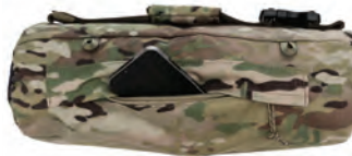
HAND HAVEN COACHYS & ASSOCIATES OCP # HH1100-OCP ALPINE #HH1100-ALP COYOTE #HH1100-COY