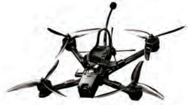
MATRIX 7 TANDEM DEFENSE #TD-M3-7-BLRS