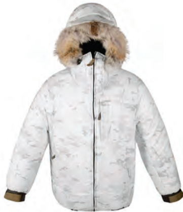
L8 | CHOSIN ECW PARKA BEYOND CLOTHING #1212P-A8-8001-C01-MCW (NO NSR) #1212P-A8-8001-C10-OCW (NSR) SIZES XS-2XL