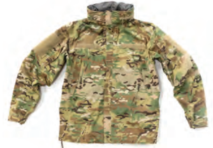
HARD SHELL JACKET - FR-GT WILD THINGS | #61286-2CY SIZES XSmall - XXXLarge