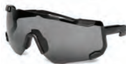
FONTANA FAST METAL NSN #01-729-1698