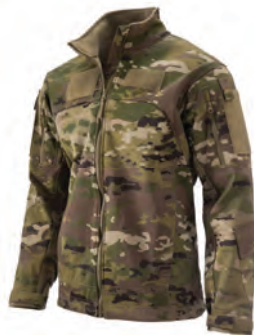
ELEMENTS™ JACKET CWAS WITH BATTLESHIELD X® FABRIC (FR) MASSIF #MJKT00059 SIZES XS-2XL