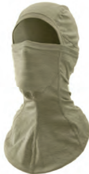
HOT JOHNS BALACLAVA (FR) MASSIF #MHDW00015