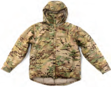
HIGH LOFT JACKET - FR WILD THINGS | #50300-9MU SIZES XSmall - XXXLarge