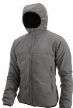
STRATO LOW LOFT JACKET (NON-FR) MASSIF #MJKT00069 SIZES XS-2XL