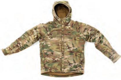
ACTIVE FLEECE JACKET WILD THINGS | #51040-9MU SIZES XSmall - XXXLarge