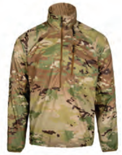
L4 | RIDGELINE WIND SHIRT BEYOND CLOTHING #1212P-A4-0118-C10 SIZES XS-2XL