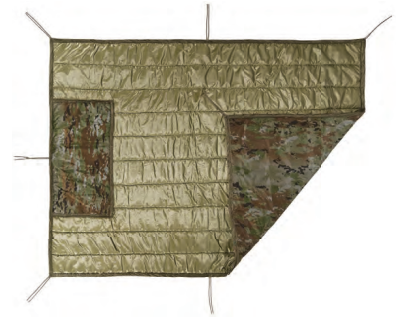
PATROL LINER STEALTH Technology OCP NSN #01-719-4173 WLD NSN #01-719-5841