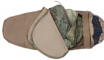
SLEEP SYSTEM STEALTH Technology NSN #01-719-4350