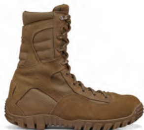
SABRA C333 BELLEVILLE