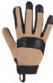
PATHFINDER COMBAT GLOVE COACHYS & ASSOCIATES NSN #01-719-4583 (LARGE)