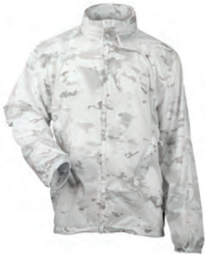
WHITE OUT OVERWHITES™ JACKET WILD THINGS | #70007-1MA (XS-XXXL)