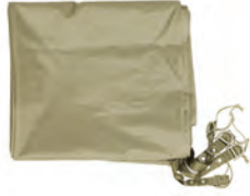
WATERPROOF GROUND SHEET LITEFIGHTER SYSTEMS LITEFIGHTER 1 NSN #01-628-9164 NSN #01-628-9164