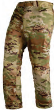
L4 | RIDGELINE WIND PANT BEYOND CLOTHING #1212P-A4-0137-C10 SIZES 28, 30, 32, 34, 36, 38, 40, 42