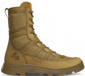
Tropical USMC EGA DANNER | # 52121