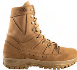
FLYWEIGHT MXG BELLEVILLE