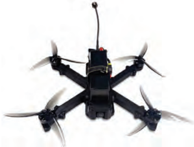
PEREGRINE X7 LITEFIGHTER TACTICAL PX1100-BLK

The Peregrine Drone and Matrix drones are built on the Matrix Architecture™, a modular ecosystem designed for durability, rapid deployment, and minimal training. Engineered for the modern warfighter, Matrix-powered systems deliver scalable reconnaissance and training capabilities while keeping costs low and mission readiness high.