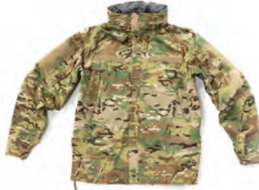
RESCUE JACKET FR-GT WILD THINGS | #52088-9MU SIZES XSmall - XXXLarge