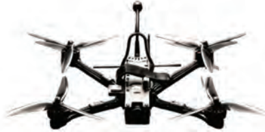
MATRIX 5 TANDEM DEFENSE #TD-M3-5-BLRS