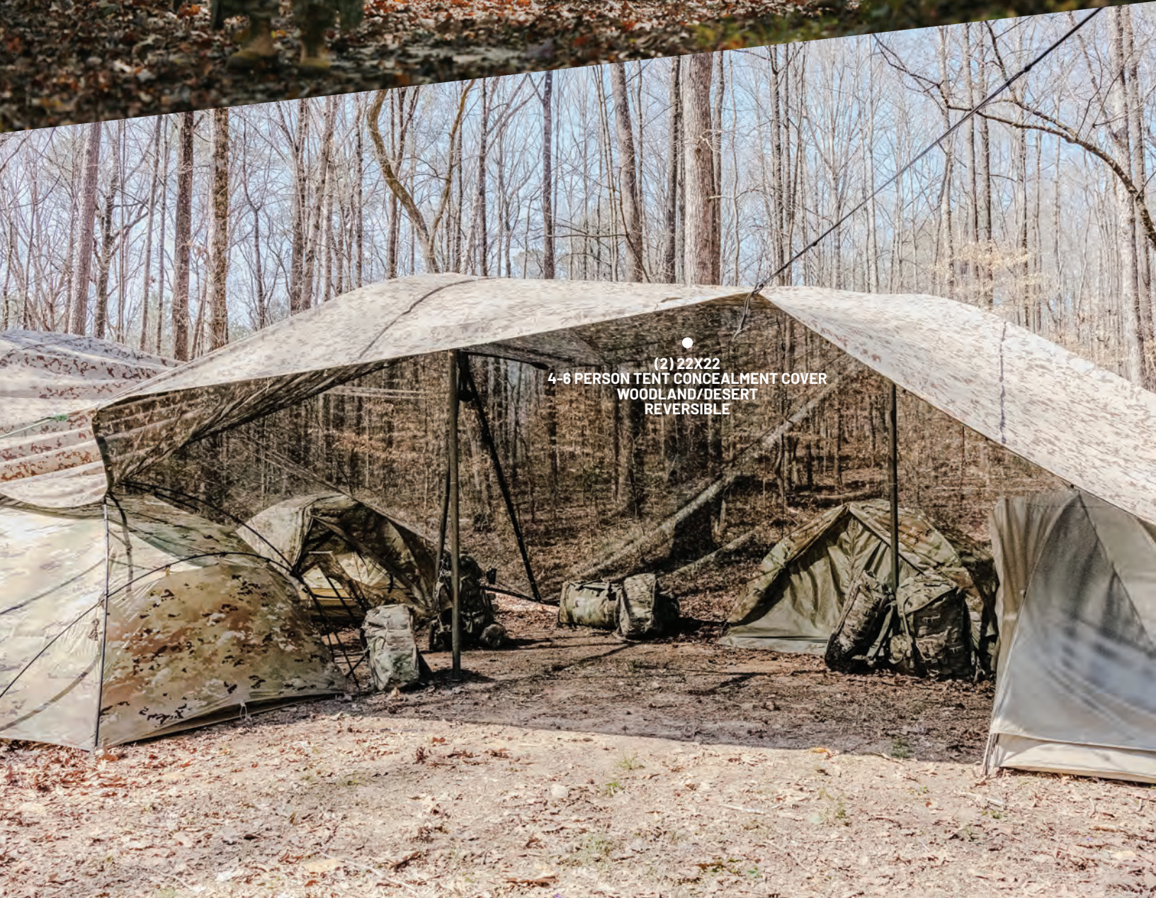
(2) 22X22 4-6 PERSON TENT CONCEALMENT COVER WOODLAND/DESERT REVERSIBLE