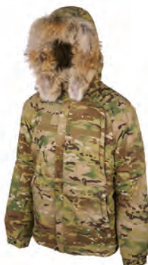
SENECA ARCTIC™ PARKA MASSIF #MJKT10247 SIZES XS-2XL