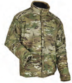
LOW LOFT JACKET - FR WILD THINGS | #50281-9MU SIZES XSmall - XXXLarge