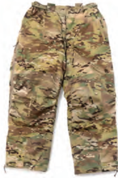
HIGH LOFT PANTS - FR WILD THINGS | #50300-9MU SIZES XSmall - XXXLarge