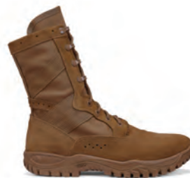
FLYWEIGHT C320 BELLEVILLE