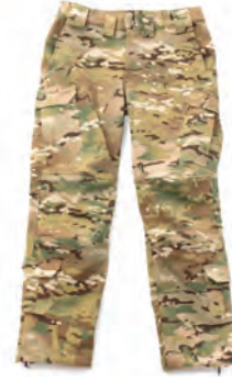
SOFT SHELL PANTS WILD THINGS | #50007-9MU SIZES XSmall - XXXLarge